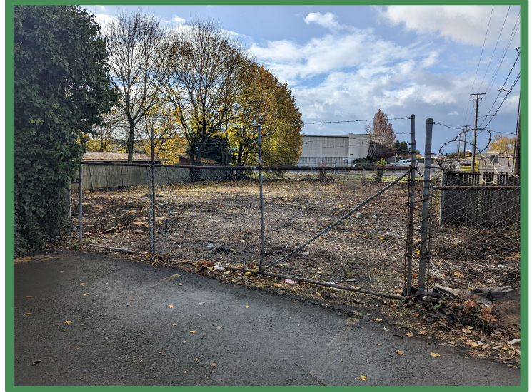
5,227 SF Fenced Yard