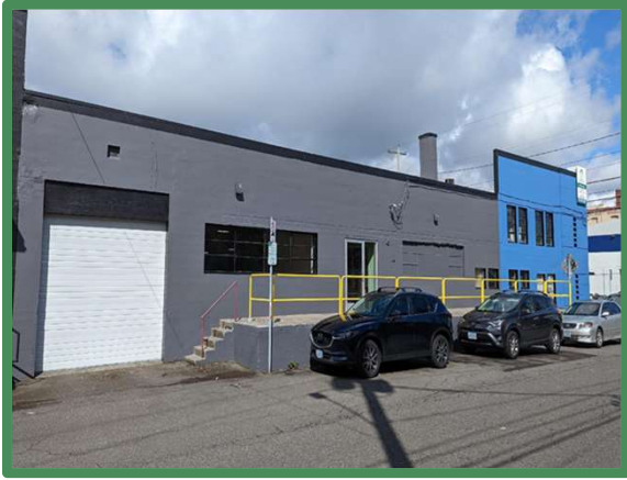
Grade Level truck door on SE 3 rd Ave