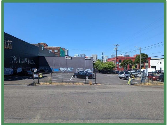
Fee Based Off Street Parking available on SE 2nd