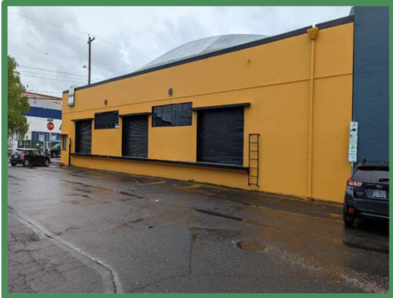
3 Dock High truck doors on SE 2 nd Ave.