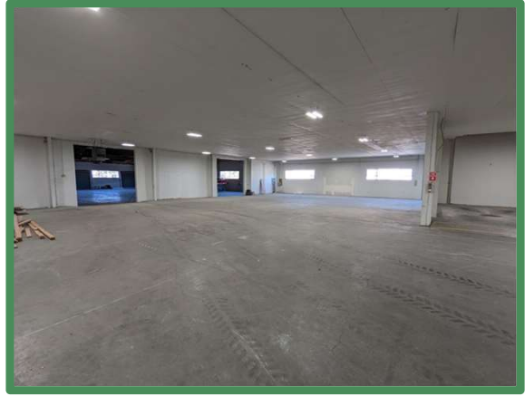
10,000 sf with access from SE 3 rd Ave.